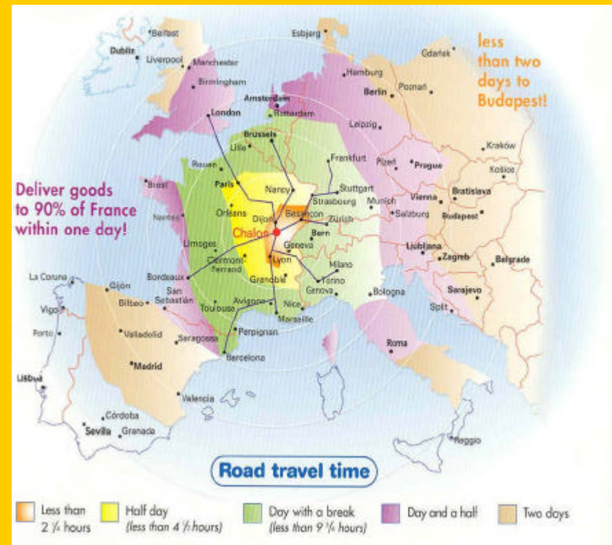
Parcel service delivery records from Chalon

40 % of intra European freight traffic goes through Chalon