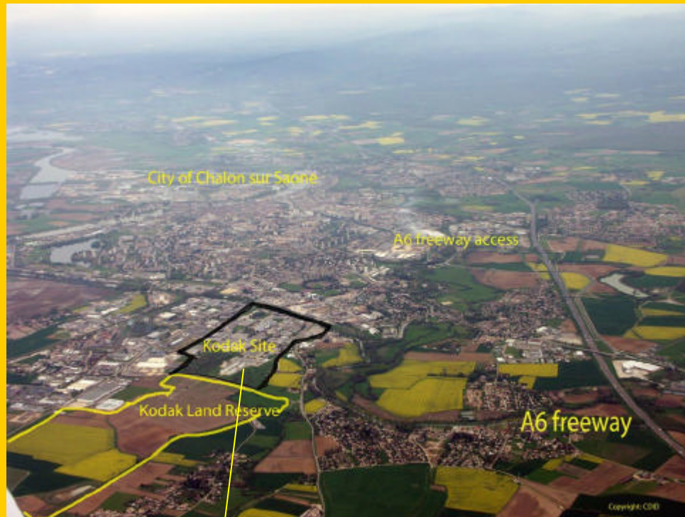
KODAK PLANT & PAN EUROPEAN LOGISTICS CENTER